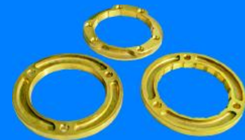
Pin - Type Synchronizers