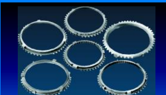
Steel Synchronizer rings