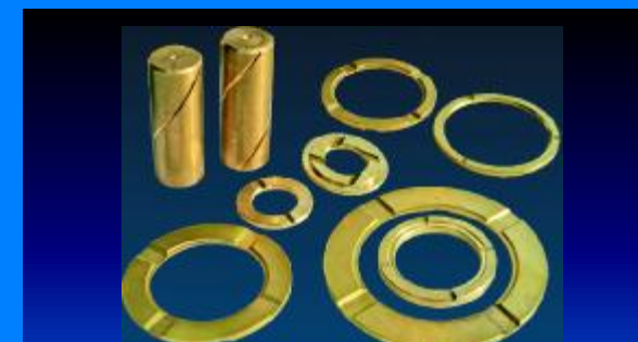
Thrust Washers & Brass Pins