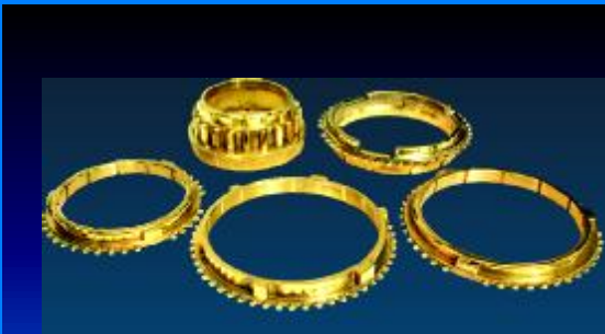
Synchronizer rings : Trucks & LCVs

Yugal Precision (Pvt) Ltd , a family owned Business Enterprise are Manufacturer and Exporters of: