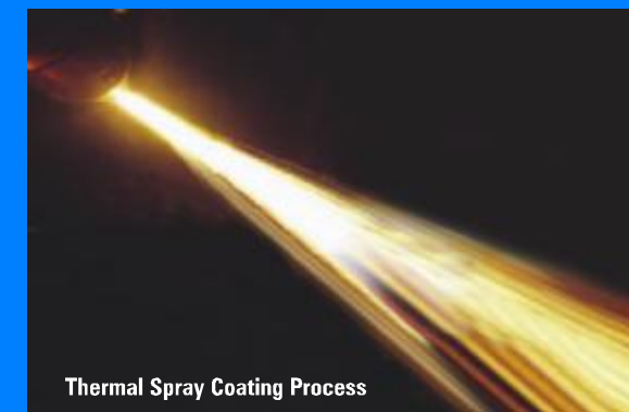
Thermal Spray Coating Process